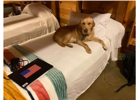
Bo (the goodest boy) making himself comfortable in his cabin.

water bottle chair in a bag or lawn chair flashlight and batteries toiletries and medications spare glasses cooler, ice is available at camp raincoat and a jacket (August nights are cold) water shoes or flip flops two pairs of shoes (one will get wet) hat, sunglasses cabins are air conditioned but you might want a fan laundry detergent if you need the washing machine musical instrument to play around the campfire closed-toe shoes and socks are highly recommended camera or use the one on your phone If you are renting a cabin, please bring your own bedding. A bedside rug is also comfy.